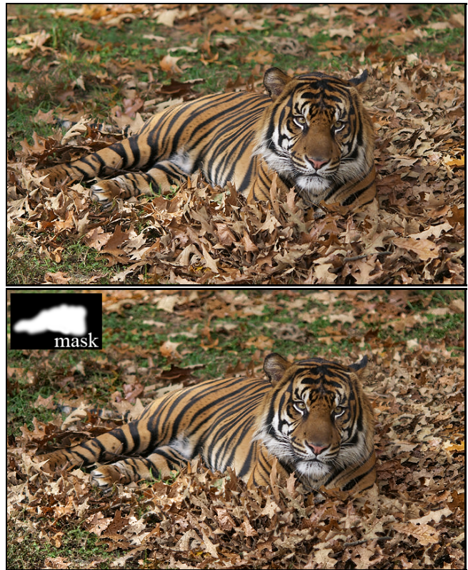
Figure 2: Specular highlights in the leaves and other distractors prevent clear foreground/background separation in the original (top) photograph. Reducing texture variation in the masked region of the bottom image de-emphasizes these distractors, thereby increasing salience of the intended subject, the tiger.